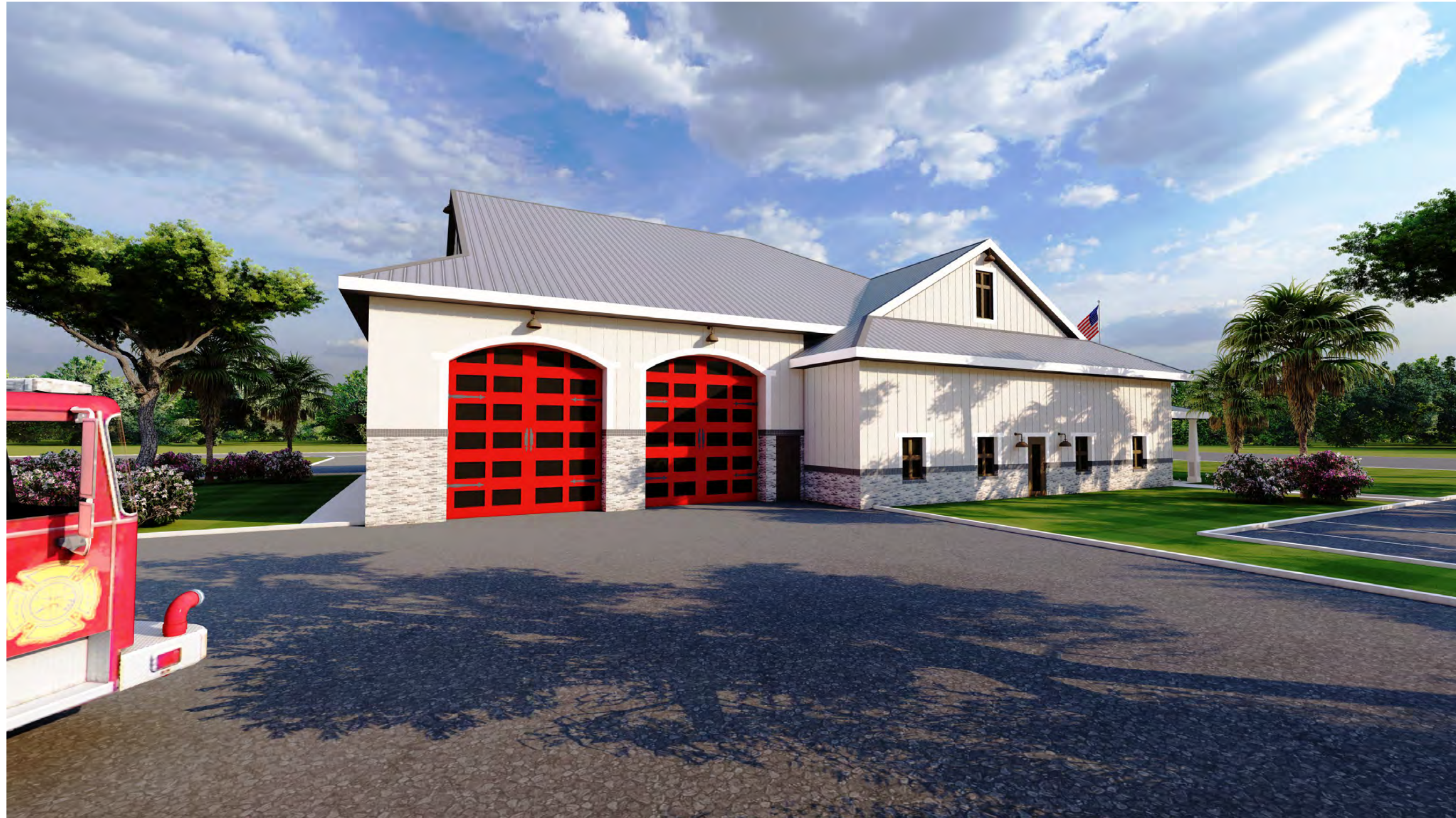
APPARATUS BAYS -RETURN SIDE