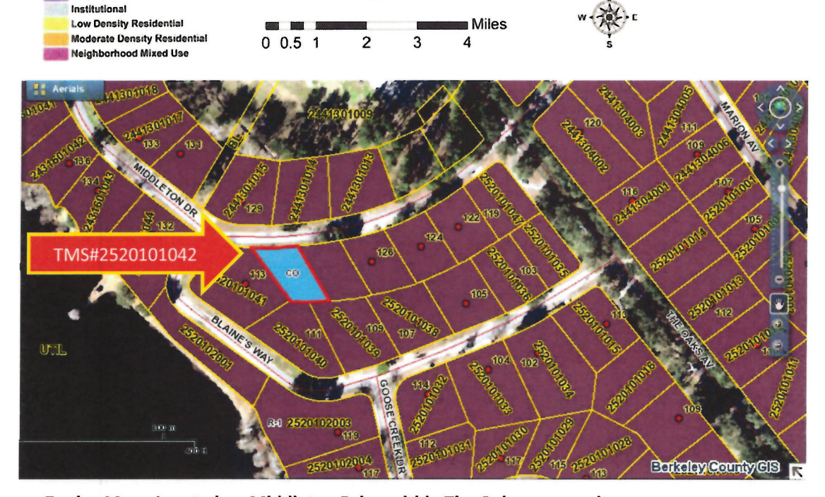
Zoning Map - Located on Middleton Drive within The Oaks community