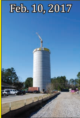
Feb. 10, 2017