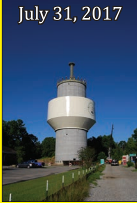
July 31, 2017