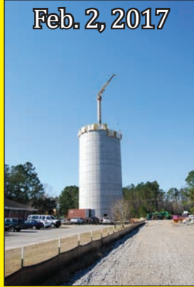
Feb. 2, 2017