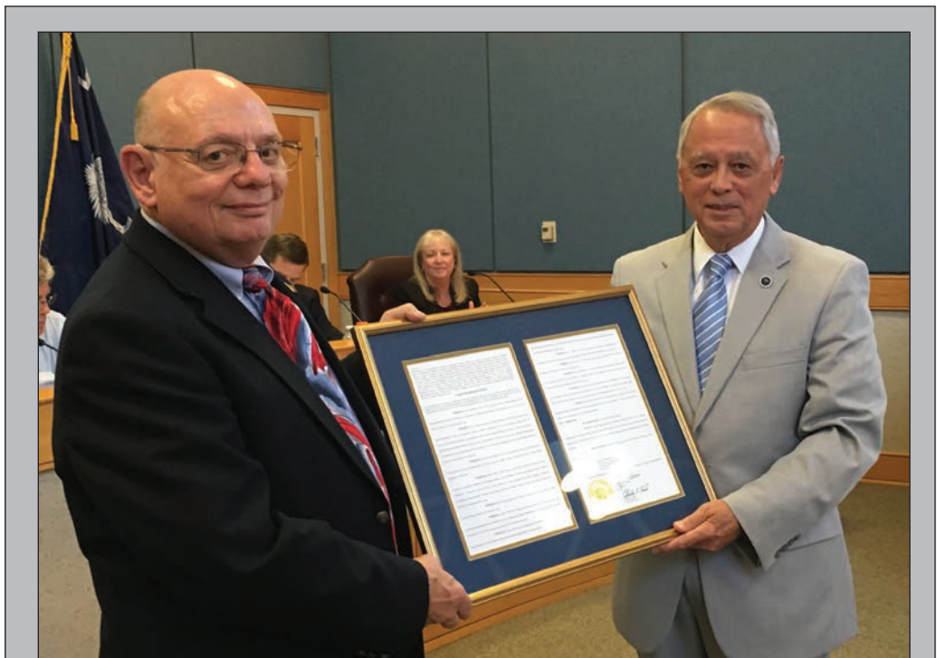
Rep. Joe Daning (right) presents Goose Creek Finance Director Ron Faretra with a S.C. Statehouse Proclamation at the July City Council meeting.

Out of the top 10 cities, Goose Creek's population has grown faster since 2010 than every city except Mt. Pleasant. The city's last seven annual population estimates are: 36,685 in 2010; 37,864 in 2011; 39,075 in 2012; 39,976 in 2013; 40,692 in 2014; 40,945 in 2015; and 42,039 in 2016.