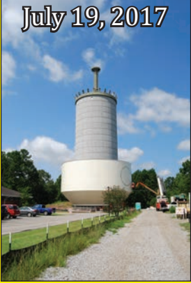
July 19, 2017