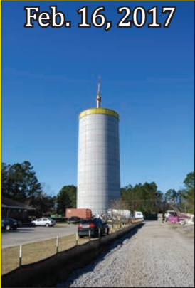
Feb. 16, 2017