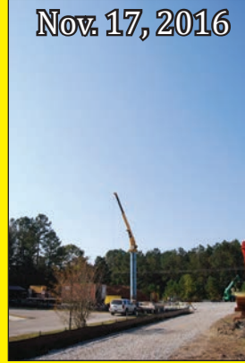
Nov. 17, 2016