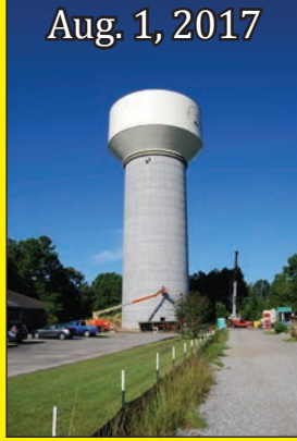
Aug. 1, 2017