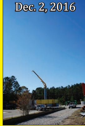
Dec. 2, 2016