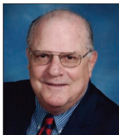
Mayor Michael Heitzler

Since the City of Goose Creek incorporated in 1961 we have been blessed with stubborn City Councils. City Councilmembers persistently refuse to raise property taxes. In fact, council has raised property taxes only three times in the last 40 years and by only 12 percent since the city incorporated 56 years ago. By comparison, if the marketplace stayed in line with