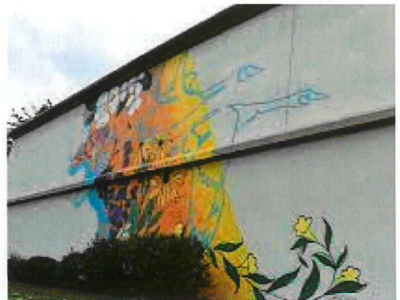
Figure 2: Example of a large public art piece.