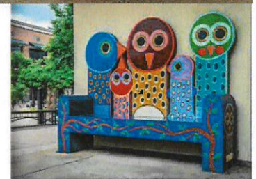
Figure 4: Examples of benches that could qualify as a small public art piece.