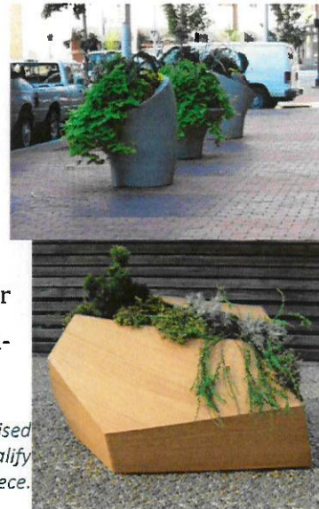
Figure 6: Examples of raised planter boxes that could qualify as a small public art piece.

(3) Raised planter boxes. Raised planter boxes qualify as a Small Public Art Piece, if they are permanently affixed to the ground, contain 50% coverage of living vegetation, are readily visible from a public right-of-way or “space open to the public”, and incorporate two or more of the following design elements: lighting; sculpture; custom concrete or woodwork; water features such as fountains or man-made streams.