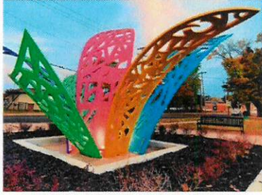
Figure 3: Example of a sculpture that would be defined as a large public art piece.

(C) Goose Creek Art Fund Created. There is hereby created a fund to be known as the "Goose Creek Art Fund" (hereinafter "Art Fund") to account for fees paid pursuant to this Chapter. The Art Fund shall be used solely: