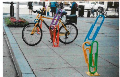
Figure 5: Examples of bicycle racks that could qualify as a small public art piece.