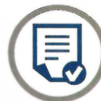
Land Use Planning